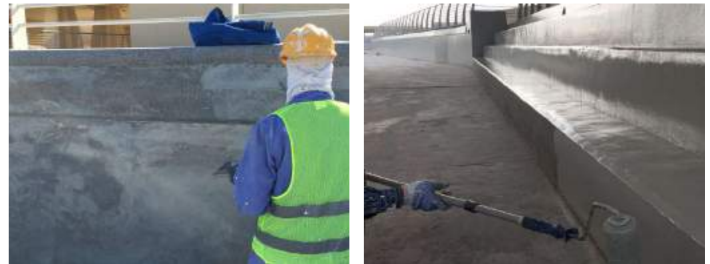
Small scale face filling between coats