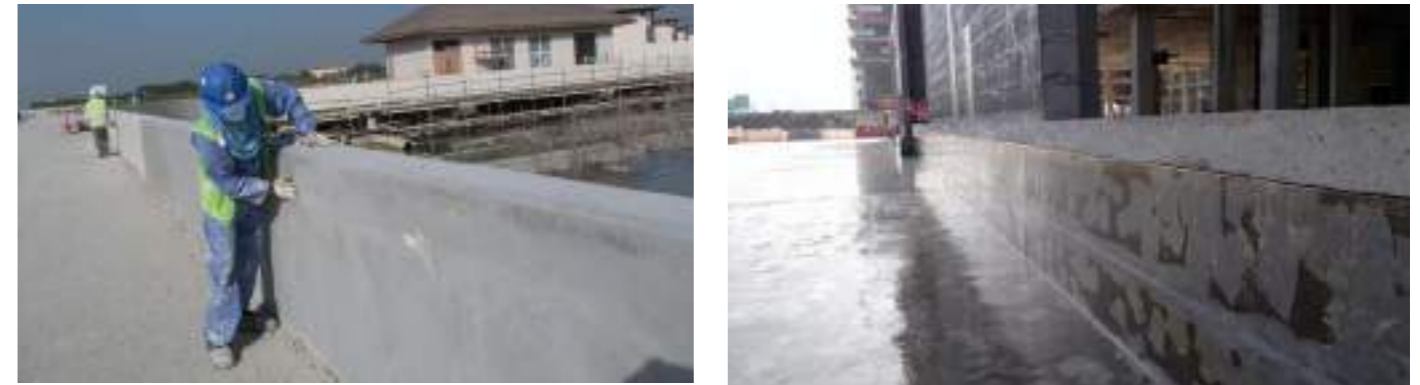
Prepare and repair